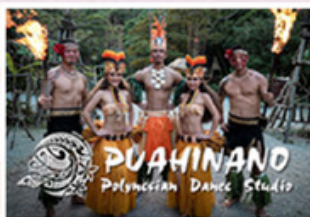
PUAHINANO Polynesian Dance Studio